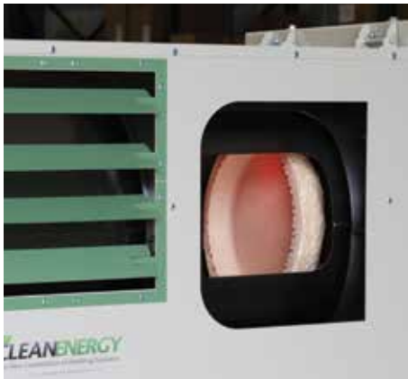
High-velocity, air-swept heat exchanger provides far better heating power and efficiency.