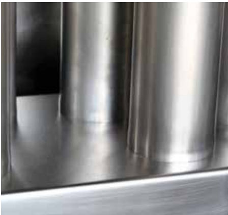
Stainless steel components resist deterioration and last years longer than the competition.