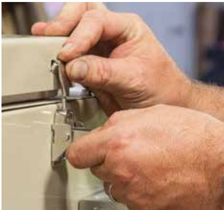
Over-center latches and smart design allow fast access for cleaning and service, without tools.