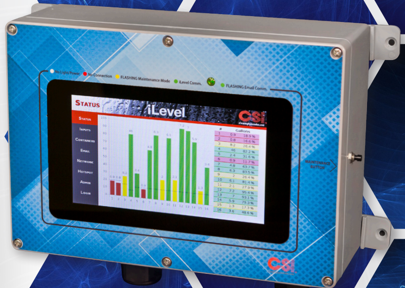
iLevel Control Box with Optional Touch-Screen