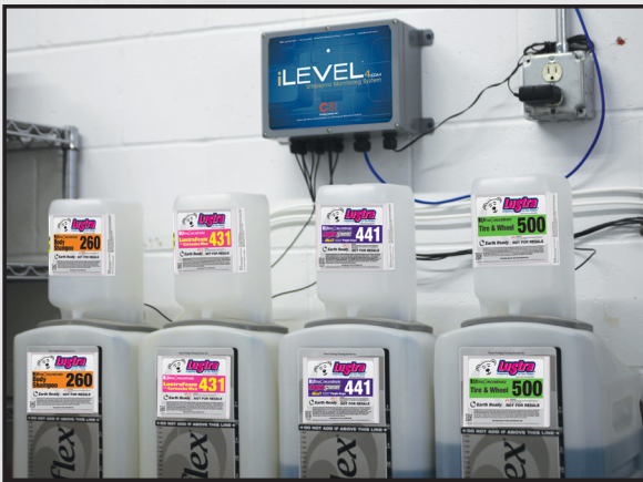
Standard iLevel Control Box